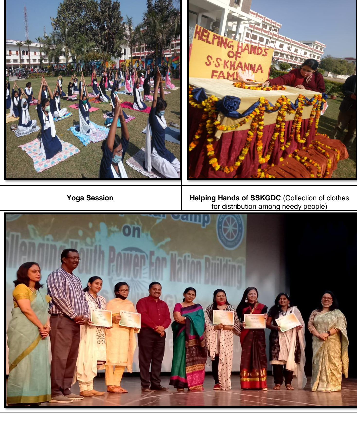
Closing Ceremony of NSS Special Camp